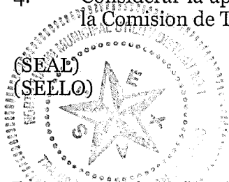
Attorney for the District Abogado para el Distrito

The District is committed to compliance with the Americans with Disabilities Act. Reasonable modifications and access to communications will be provided upon request. For questions, please call (512) 435-2300. Hearing impaired or speech disabled persons equipped with telecommunications devices for the deaf may utilize the statewide Relay Texas program; (800) 735-2988. All other questions should be directed to Crossroads Utility, (512) 246-1400.